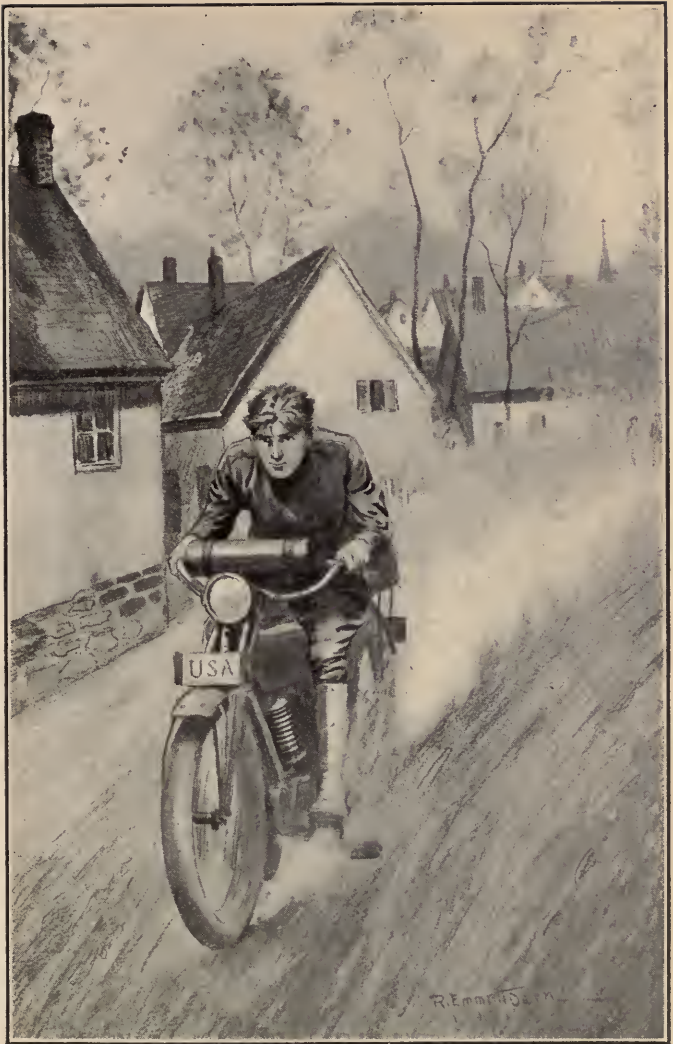
DOWN THE HILL COASTED UNCLE SAM BEARING TOM FURIOUSLY ONWARD.